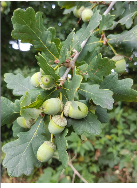
Fig 2. Leaves and acorns of an English Oak