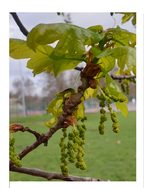
Fig 1. Catkins on an English Oak in April

Holm Oaks ( Quercus ilex ) originate from Southern Europe and are evergreen, and they can be seen all over the Park. There are some fine examples in the area north-east of the Pump House, and the tree west of the Pear Tree Café usually has lots of acorns in the summer. There is wide variation in the shape, size and colouring of the leaves. Some leaves have spiny lobes like a Holly ( Ilex aquifolium ) - the scientific name of Holly is Ilex aquifolium because of the