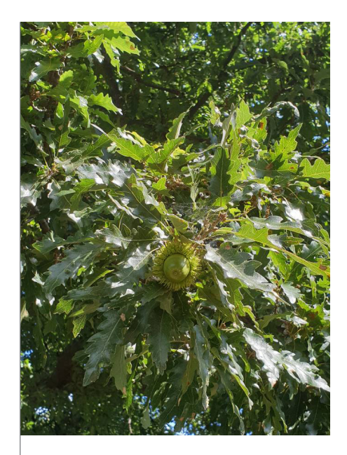
Fig 3. Leaves and acorn of a Turkey Oak