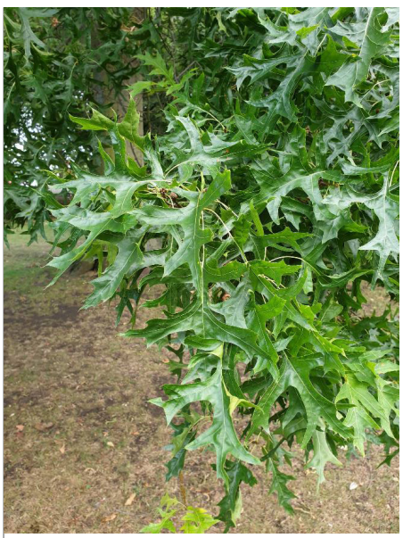
Fig 5. Leaves of Pin Oak